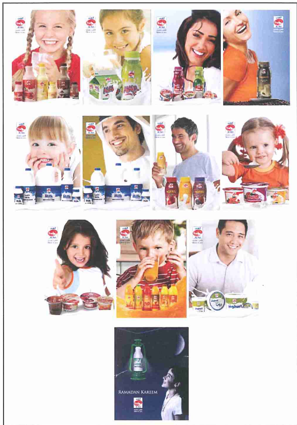
Figure 3 Al Ain product portfolio and advertisement

Since 1992 Al Ain Dairy has mainly focused on three major categories of dairy and juice products. These are: